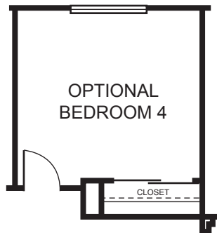
OPTIONAL BEDROOM 4 AT LOFT