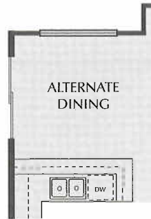
First Story Alternate Dining